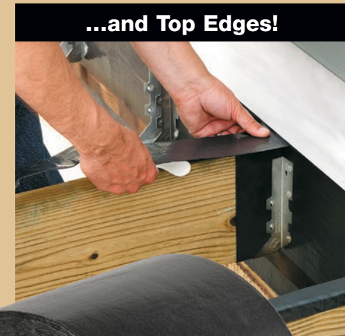
...and Top Edges!

■ ACQ-treated lumber causes most metal components to corrode, however, DeckWrap PowerBond® eliminates this problem as the protective barrier between the wood, metal joist hangers, and the support beam brackets.