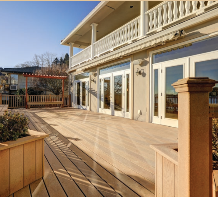
DeckWrap PowerBond® is ideal for use with composite wood decking that utilize ACQ-treated structural lumber.

DeckWrap PowerBond® is also available in three convenient widths – 3-, 6- and 12-inches – for a variety of applications. Far superior to similar products because of its composition and unique construction, DeckWrap PowerBond® is the “must use” product to significantly extend the life of every deck.